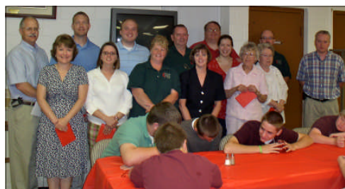
Teacher Appreciation Celebration