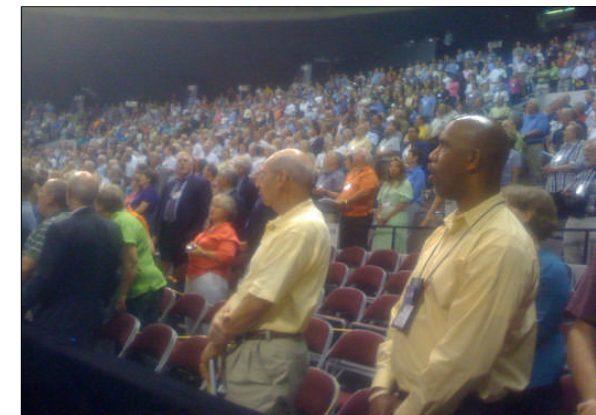
Scenes from 2009 Annual Conference