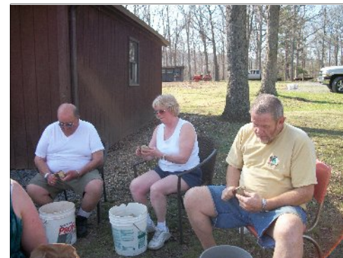
The Round Hill 2010 Potato Patch Planters