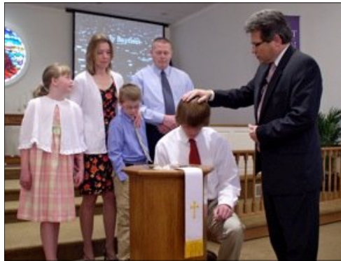
The Pate Family