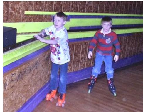
The SKFC and FROGS having a rolling good time at Mac's Roller Rink in February.