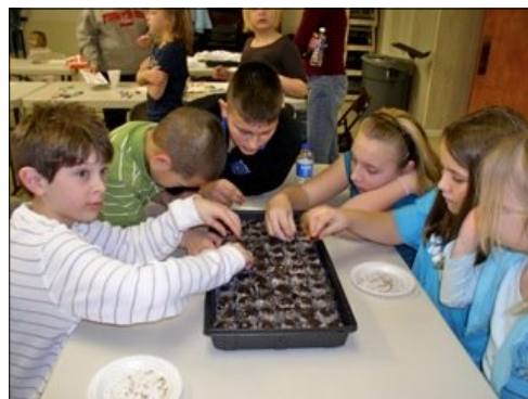
The FROGS and SKFC seem to have their little fingers into a lot of activities.