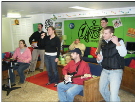
Game Night at the Church (Playing: Rock Band 2)