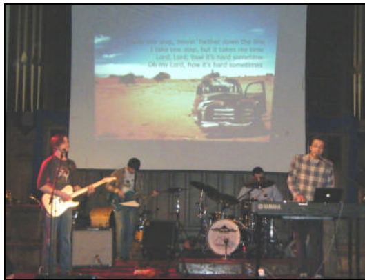
CrossLink (Worship Band: Stereoreel)

If you are between the ages of 18 and 30 and would like to join us, we welcome you! If you need more information contact the church office.