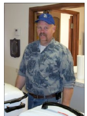
The United Methodist Men serve up a tasty Pancake Breakfast.