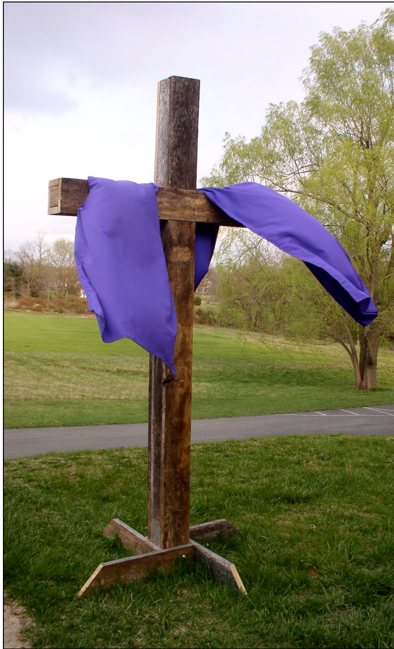
The old rugged cross will again be displayed in the church court yard adorned with the colors of the season. It will remind passersby that Lent is a season for repentance and preparation for the events of Holy Week and Easter.